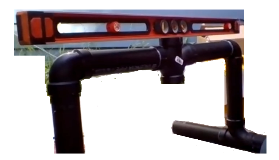
Fig 2. Installation of the apparatus feet.

VIII. Cut the 2 inch pipe (Item a) at 7 feet and mount it on top of the double tee (Item d) at the center of the apparatus. Measure and mark this vertical pipe at an elevation of 50 cm measured from the horizontal surface where the apparatus is standing. Continue measuring and marking the pipe at 25 cm increments until reaching a final mark at an elevation equal to 200 cm.