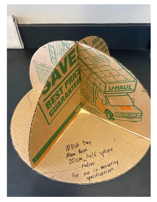
Fig 2. Sample internal measurement tool.